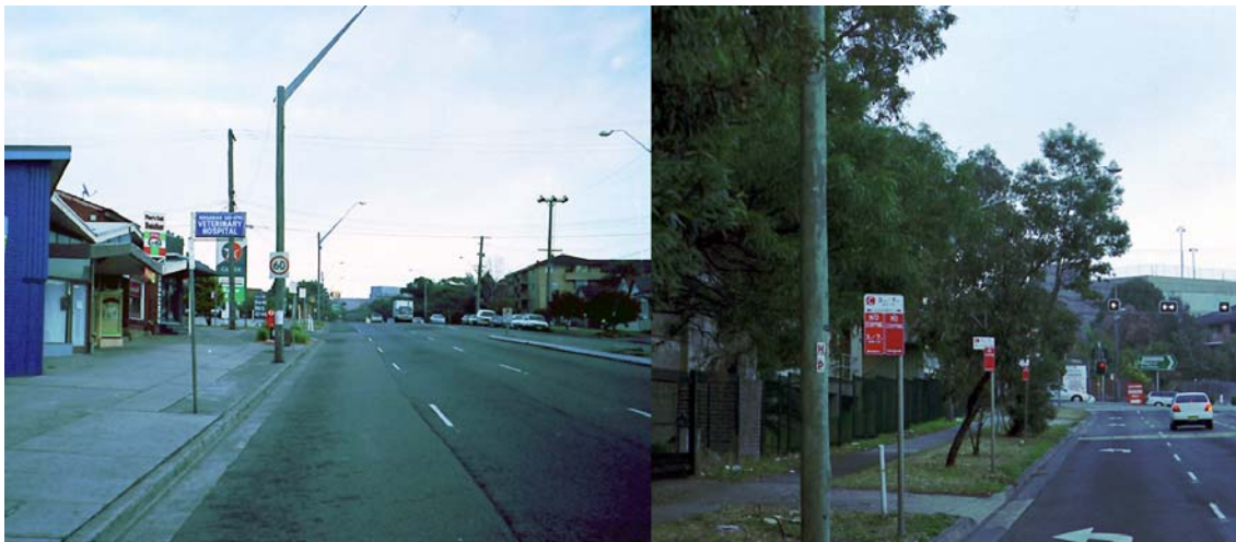
Figure 2: Photos from Kogarah show a 60km/h sign (photo on left) and a 40km/h school zone sign hidden (photo on right), only a few hundred metres up the same stretch of road. The speed camera patrolling this section of road draws in $127 per minute during school zones. According to a magistrate at Sutherland court and another at Sydney District court, a motorist should be able to comply with the 40km/h speed limit even though the speed limit sign is hidden behind the tree.

In Sydney, speed limit signs are commonly concealed so that motorists travel at speeds exceeding the posted (but hidden) speed limit. If the speed limits were there in the interest of safety, then it would be prudent to have them exhibited openly and not hidden. Examples of this can be found at North Sydney, on the Pacific Highway, and on President Ave at Kogarah, where school zone signs are obscured, hidden and concealed preventing motorists who do not normally travel the routes from seeing them and hence, complying with the law. In the case at Kogarah, the sign is visible for about 15 metres, whereas the RTA site explains that it takes 29 metres to slow from 60km/h (the speed limit prior to the school zone) to 42km/h (the school zone speed limit is 40km/h) (see figure 2). Hence, it is impossible to comply even if the driver managed to see the sign in the split second afforded them. This may explain part of the reason why this speed camera is taking the millions of dollars per year as shown above. If proper signage had been placed there, the revenue raised would be lessened and safety may be improved as drivers become aware of the up-coming school zone with enough notice to modify their speed.