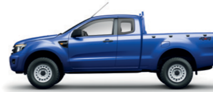
XL Super Cab Pick-up 3.2L Diesel Manual