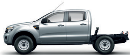
XL Double Cab Chassis Hi-Rider 2.2L Diesel Auto