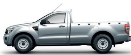
XL Single Cab Pick-up 2.2L Diesel Manual