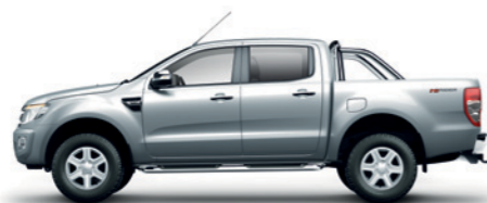
XLT Double Cab Pick-up Hi-Rider 3.2 Diesel Manual (Auto Option)