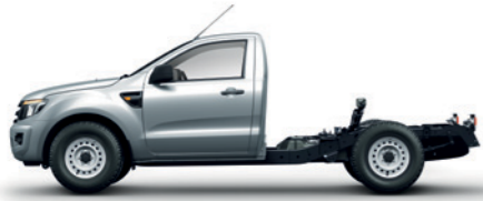
XL Single Cab Chassis 2.5L Petrol Manual