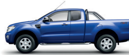
XLT Super Cab Pick-up 3.2 Diesel Manual (Auto Option)