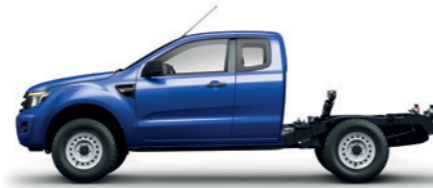
XL Super Cab Chassis 3.2L Diesel Manual