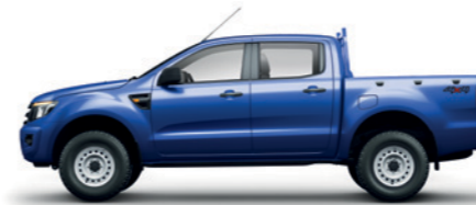
XL Double Cab Pick-up 2.2L Diesel Manual (Auto Option)