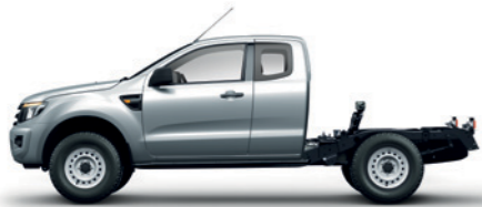
XL Super Cab Chassis Hi-Rider 2.2L Diesel Auto