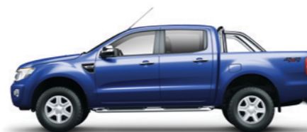
XLT Double Cab Pick-up 3.2L Diesel Manual (Auto Option)