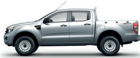
XL Double Cab Pick-up Hi-Rider 2.2 Diesel Manual (Auto Option)