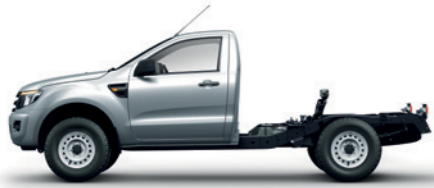
XL Single Cab Chassis Hi-Rider 2.2L Diesel Manual (Auto Option)