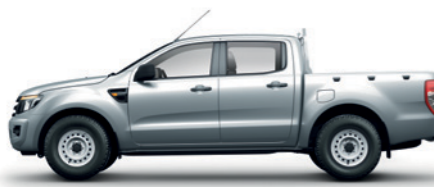
XL Double Cab Pick-up 2.5L Petrol Manual