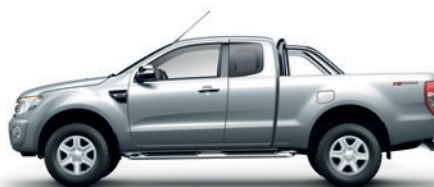
XLT Super Cab Pick-up Hi-Rider 3.2L Diesel Auto