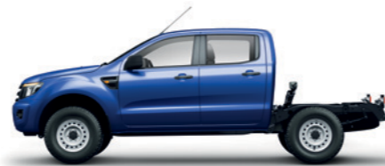
XL Double Cab Chassis 2.2L Diesel Manual (Auto Option)