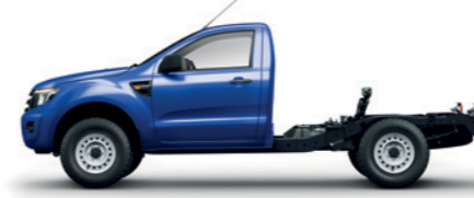
XL Single Cab Chassis 3.2L Diesel Manual (Auto Option)