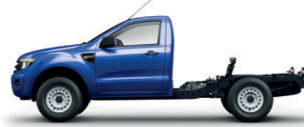
XL Single Cab Chassis 2.2L Diesel Manual