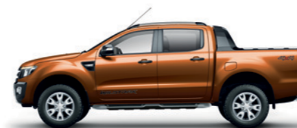
Wildtrak Double Cab Pick-up 3.2 Diesel Manual (Auto Option)