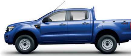
XL Double Cab Pick-up 3.2L Diesel Manual (Auto Option)